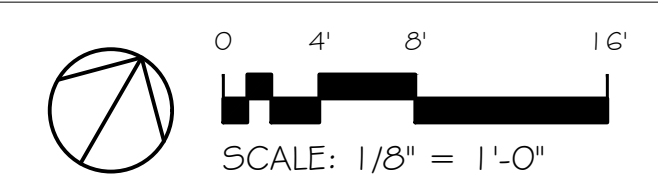
PROPOSED FLOOR PLAN 1/8" = 1'-0"

Y:\GOLDSTONE ARCHITECTURE - DOCUMENTS\PROJECTS\CASTLETON VILLAGE SCHOOL\G-DESIGN PHASE\3-AUTOCAD\3-SHEETS\ARCHITECTURAL\PROPOSED CONDITIONS\A102 PROPOSED FLOOR PLAN.DWG